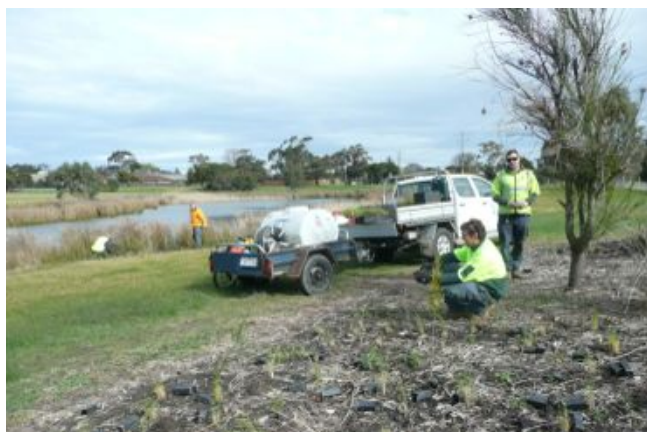
Yammerbook Nature Reserve Planting Saturday 3 August 2013