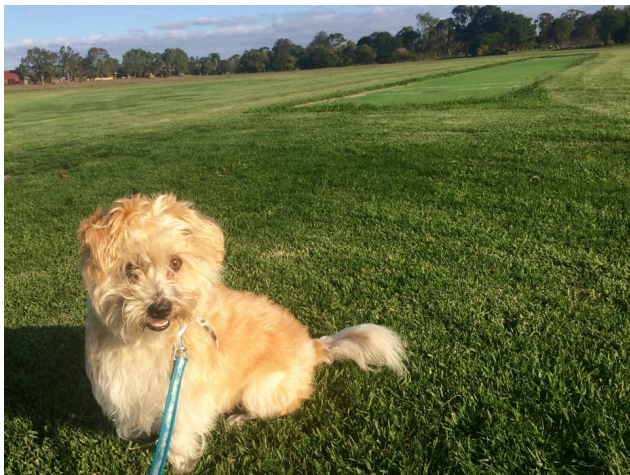
Photo: Aspendale Gardens Resident Roxy the Wonder Dog checks out the Aspendale Gardens Sportsground

Facebook: www.facebook.com/agra3195 Email: agrasecretary@gmail.com Web: www.agrainc.org.au