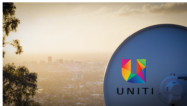
Photo: Uniti Wireless looking for expressions of interest from Aspendale Gardens Residents

For more info visit www.unitiwireless.com