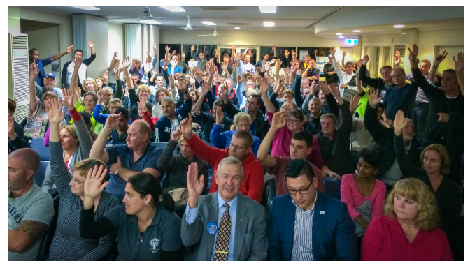
Photo: Aspendale Gardens Public Meeting, Thursday 12 May 2016

The Aspendale Gardens community centre had standing room only as residents asked questions and expressed concerns. The vast majority of attendees voted by show of hands to oppose the development.